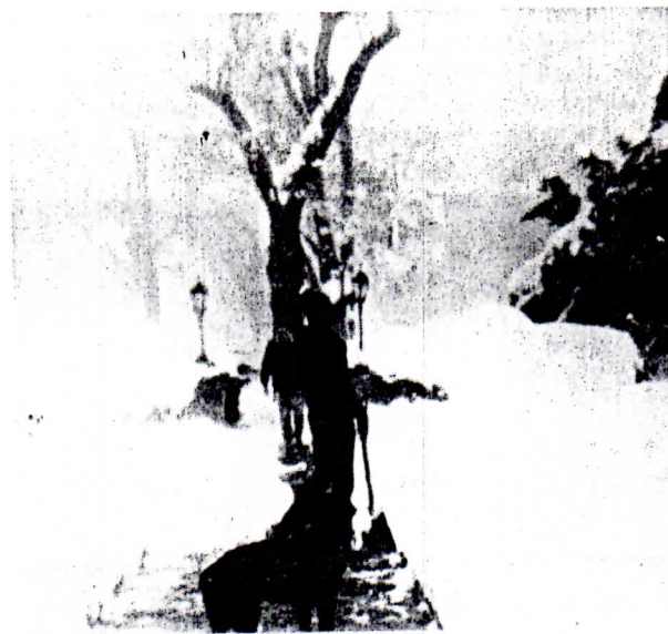
How-deep the snow. Take a look at the Club front yard!

wishes of every one in attendance. We had a western band this year and they were really swinging, picking and a singing. Want to extend to you all our best wishes for a Happy New Year and do make a resolution to use your club as much as you can.