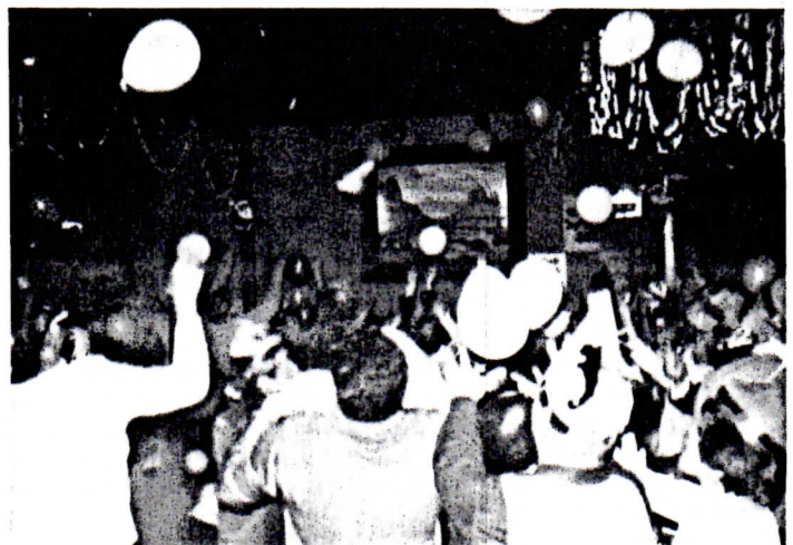
"Ringin' out the Old and in the New" at the Ranch Club New Year's Party.