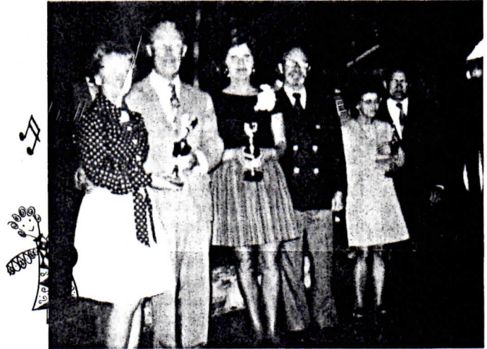
Winners of Waltz contest - Harvest Moon Dance.