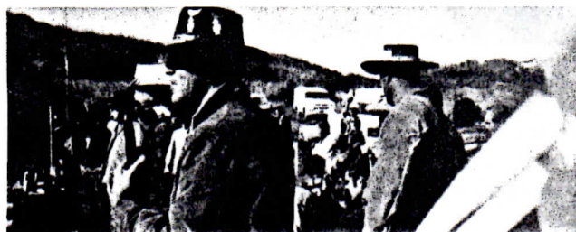
"High Desert Muzzle Loaders" trap shooting.