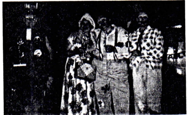
Winners of Halloween Costume Ball.

What a wonderful fall season we are having—it's so warm—it's shirt sleeve weather—Love It!