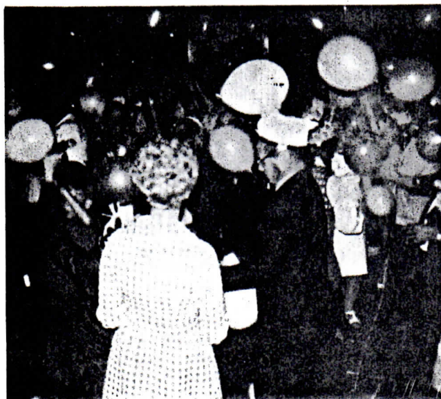
A typical New Year's Eve party at the Club.

Have you seen the geese? We've been invaded again this year by Canadian geese. Even a dozen of the white snow geese have been feeding on our lake. They arrive every morning eat all day on the lake, and take off each evening in their "V" formation, honking all the time.