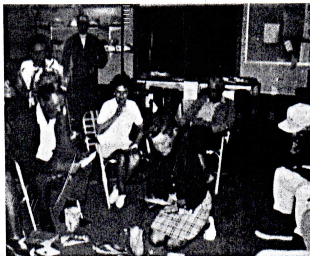
Hacker's Party in Pro-shop.

Now we start the Christmas fun, first party is at the Pro Shop. Hackers for Christmas has always been a favorite pot luck dinner cooked by our women golfers. The Men's club furnished the ham. Everyone ate and ate, the food was so good!! A few funny games, and then a gift exchange.