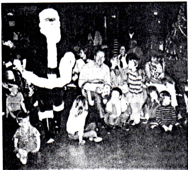
Santa Claus & Mrs. Santa's annual visit to the Club.

The Club house tree is a beauty. It's a living tree and after the holidays will be planted on the grounds. All the permanent residents helped with the decorations. A prize was given for the longest paper chain in a given time limit. The kids had glue up to their arm pits, but they had a good time, with a wonderful showing of community spirit and wholesome fun.