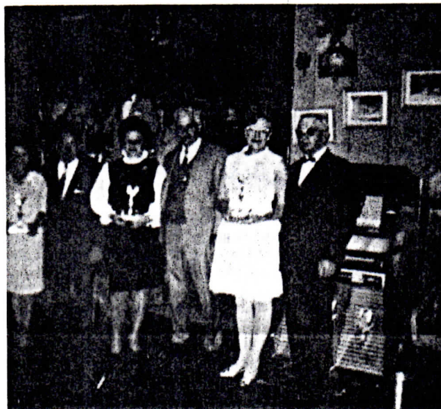
Winners of "Harvest Moon Dance" Contest